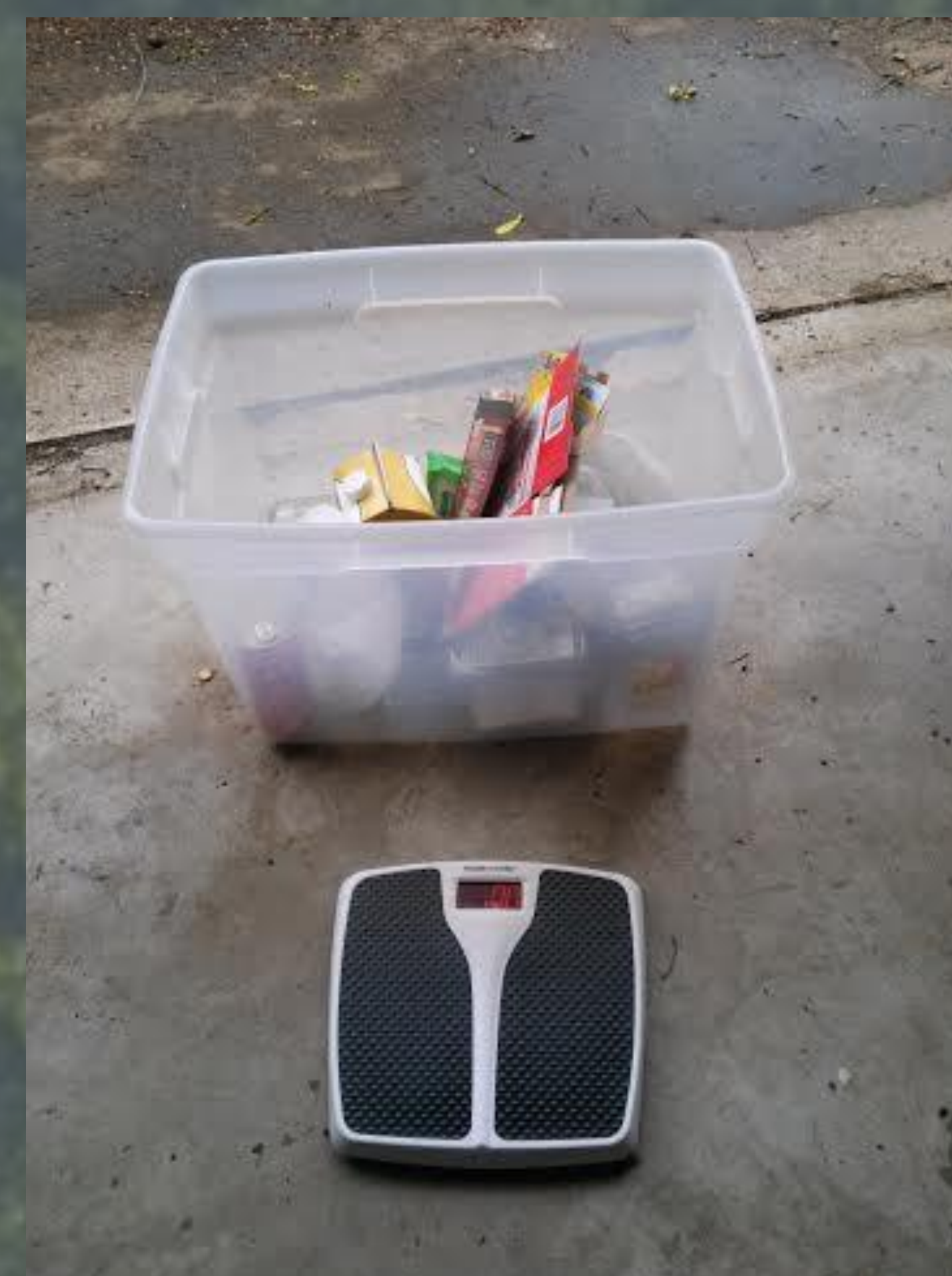
Weighing the recycling