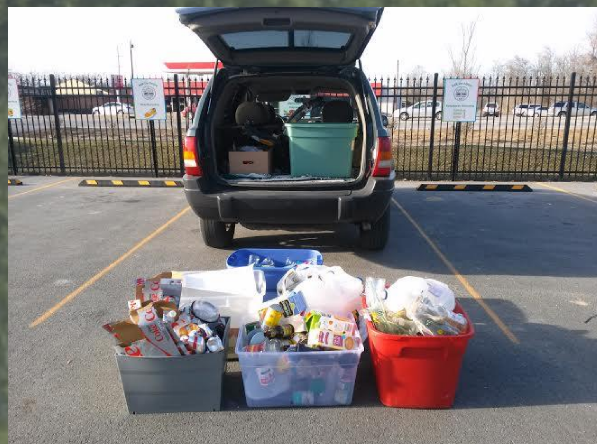
Dropping off a full carload of recycling to the Marion Orton Recycling Center

Four close friends of mine live in apartment buildings and did not recycle before they agreed to be part of my experiment. I provided each unit with one recycling bin and picked it up every Wednesday afternoon for five weeks. I then weighed, sorted, and recycled everything in these bins. I compared my data with the City of Fayetteville's to see how much waste could be saved and how much money could be earned if recycling was provided to apartment dwellers in Fayetteville.