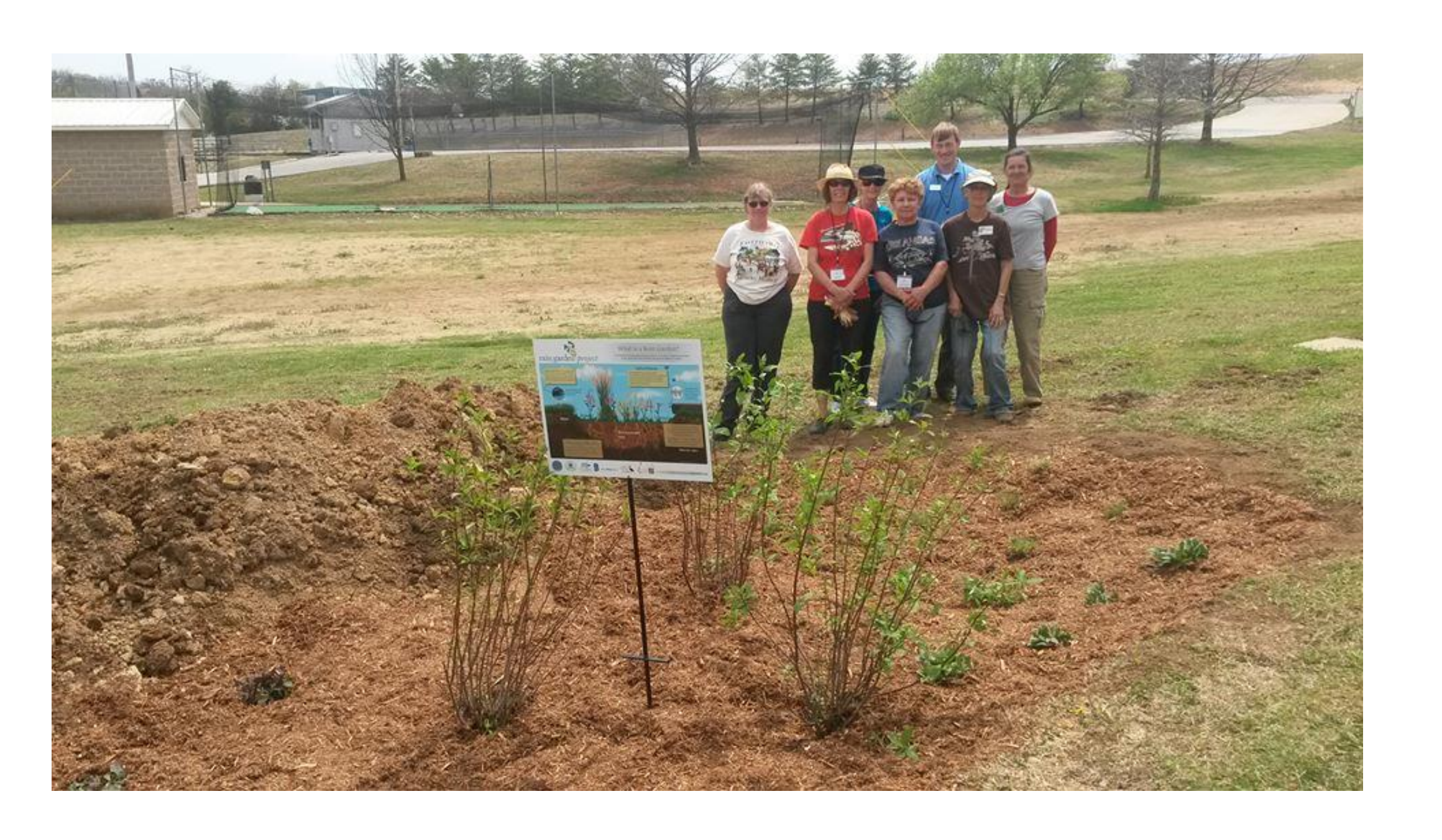
Rain Garden Planted at Mitchison Park Huntsville, AR

The participants in the Rain Garden Academy also demonstrated an attitude change in favor of additional commitment to future environmental stewardship. In the Pre-Test, there were only two participants who said they could not commit to performing one of the given options for environmental stewardship and that lowered to only one participant in the Post-Test, empirically proving that this mechanism is also effective in changing attitudes in favor of commitment towards stewardship.