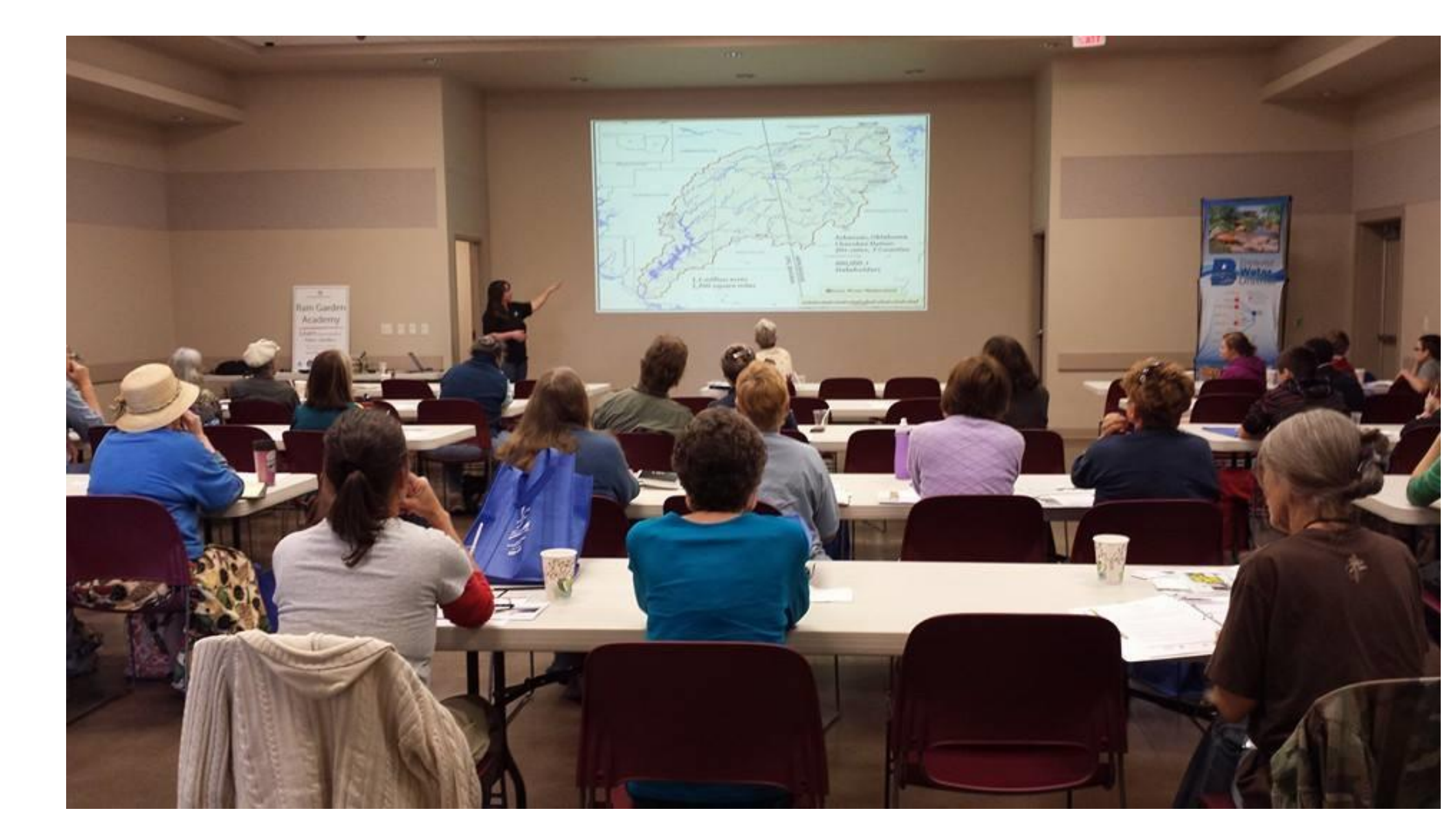
2014 Rain Garden Academy

The participants in the Rain Garden Academy demonstrated an increase in knowledge on each of the curriculum questions asked in the survey other than the one (question 4) that they all got correct both times. Though the test group was only 21 people, this is a good way to empirically prove that the combination of lecture and hands-on education is effective.